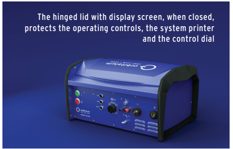
The hinged lid with display screen, when closed, protects the operating controls, the system printer and the control dial