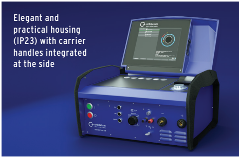
Elegant and practical housing (IP23) with carrier handles integrated at the side