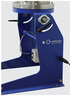
Robust steel structure, excellently suited for use even under extreme process conditions