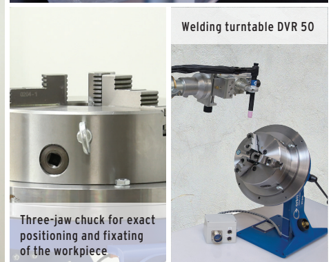
Welding turntable DVR 50