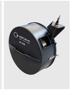
Cold-wire supplies DVR (retrofitting kits) for welding with cold wire including feed motor and wire adjusting unit