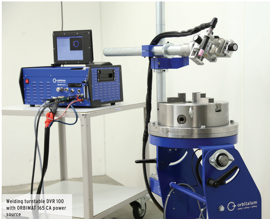
Welding turntable DVR 100 with ORBIMAT 165 CA power source

The turning gears of Orbitalum for the mechanical TIG orbital welding are a reliable and efficient solution for the welding of rotating workpieces, short molded parts and fittings.