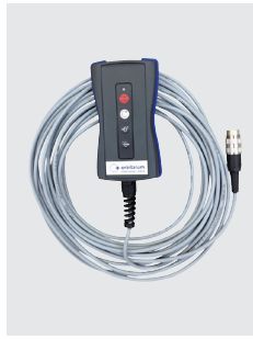
Remote controls for higher operator comfort (available separately)