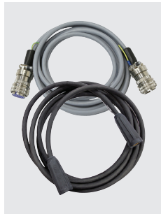
Control cable and ground cable (available separately)