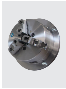
Three-jaw lathe chuck (available separately)