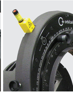
Integrated line laser to determine the cut off point