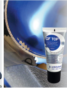
Saw blade lubricant GF TOP included