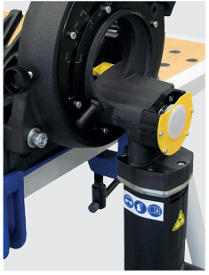
Second saw blade position to cut off elbows