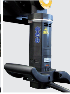
Powerful drive with electronic overload protection and ergonomically designed motor handle