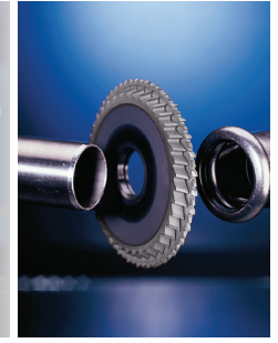
Square, burr-free and deformation-free pipe end - ideal for pressfitting applications